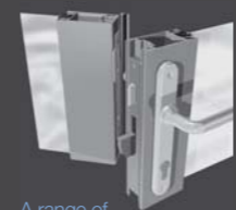
A range of handle styles and colours.